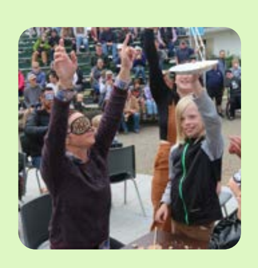
P.S. Get your exhibits ready!

More information will be available about all these topics in the months to come. Your support is needed and greatly appreciated to put on this amazing community event. TO DONATE PLEASE CLICK: donation form.