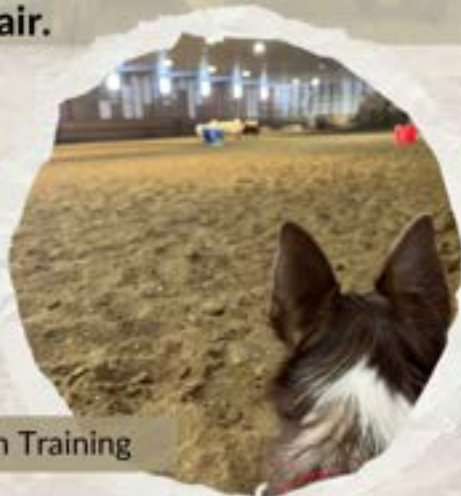
TEA in Training

Follow us on Social Media to see Fair photos, videos and stay in touch with the Fair.