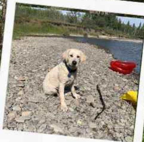
FUN IN THE CREEK