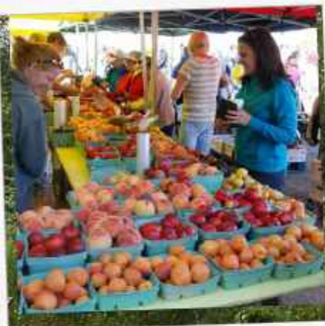
FARMERS' MARKETS ALL SUMMER!