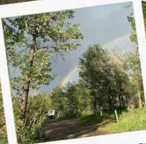
ALL NATURAL, LARGE SITES