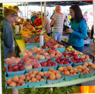
FARMERS' MARKETS ALL SUMMER!