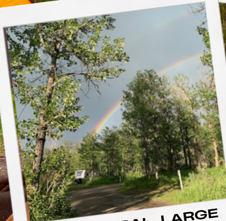
ALL NATURAL, LARGE SITES