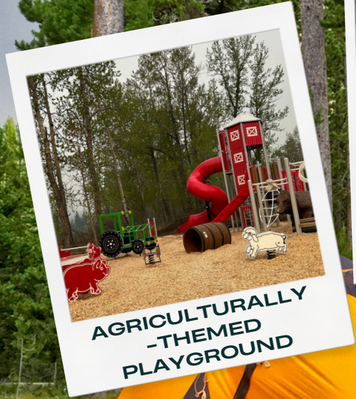
AGRICULTURALLY -THEMED PLAYGROUND