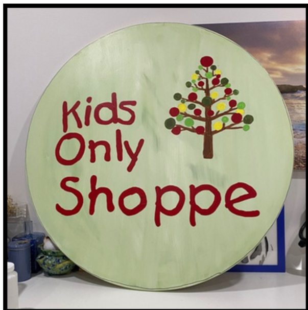
Painting by Pam